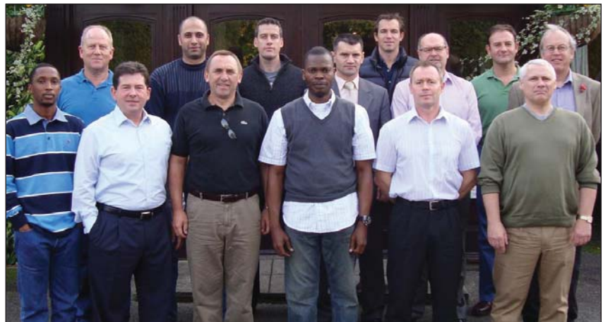
Candidates attending the intensive ARC CPP Preparation Programme in readiness to sit the examination. (As well as UK Chapter members, this autumn’s group included candidates from Azerbaijan, Egypt, Nigeria, and Uganda.)

ASIS professional certification is important to my organisation and I now join my US work colleagues in taking the PSP Exam to give recognition to my technical expertise and experience in the Security Industry. I chose to take the PSP test first rather than the CPP as I believe a proven technical understanding is important in the application of security solutions.